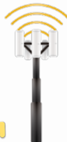
Wireless Data Connection

Knowing your total cost of operation (TCO) provides business intelligence above and beyond simply knowing asset ownership costs. Improving cost management of trucks, fleets and labor is made possible with comprehensive monitoring and reporting of operational costs which can include contract costs, maintenance, acquisition, labor (when operator access data is enabled) and more. Cost of operation can be viewed and analyzed by truck, by fleet and by location. You'll benefit with increased knowledge of actual fleet utilization and costs to help you get the most value from your material handling assets.